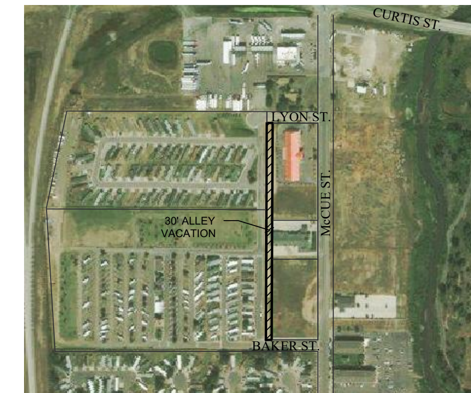
VICINITY MAP SCALE: 1"=500'